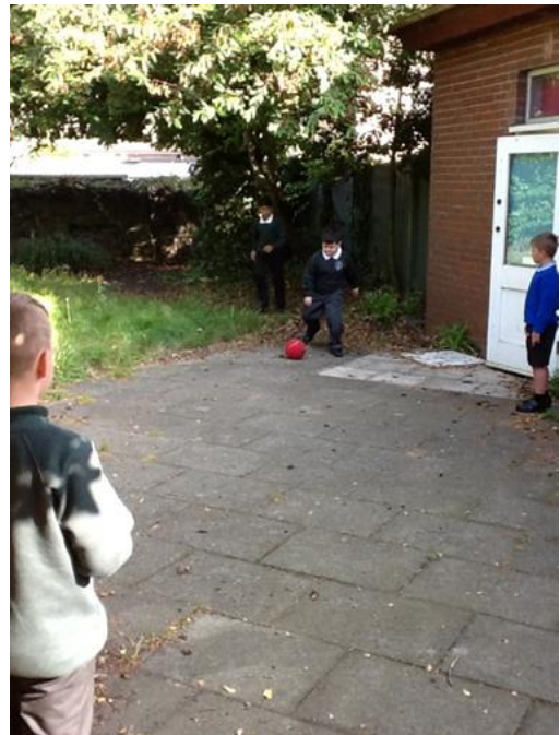
Social games and team work