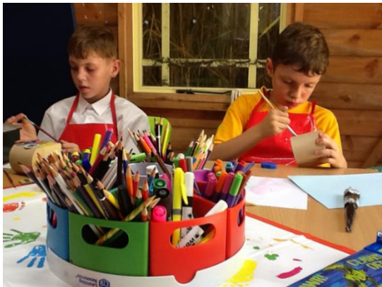
Designing and making our own treasure chests