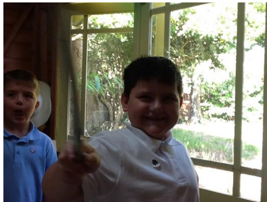
Making wands for Cinderella